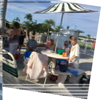
On Sunday morning, June 26, a few OM residents brought some refreshments and enjoyed the pool and company of our full time residents. Life does go on in OM!